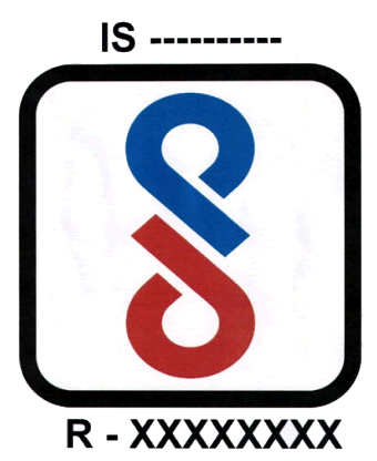
Fig. 1 Standard Mark for Compulsory Registration Scheme, Bureau of Indian Standards

For R&D, Table I and Table II which describes the standards related to product type are important. Conventional R&D methodology for product development involves compliance testing after pilot production. Although compliance testing at this stage is necessary, one should additionally bring the compliance testing during proof of concept, design and prototyping stages or in other-words during R&D stage as per modified Nair's Product Development Cycle to improve the confidence of industry during pre-competitive R&D [6]. The modified Nair Cycle is described in Fig 2. Bringing the compliance testing earlier can potentially attract industrial partners during R&D stage and increase the rate of transfer of technology after R&D stage.